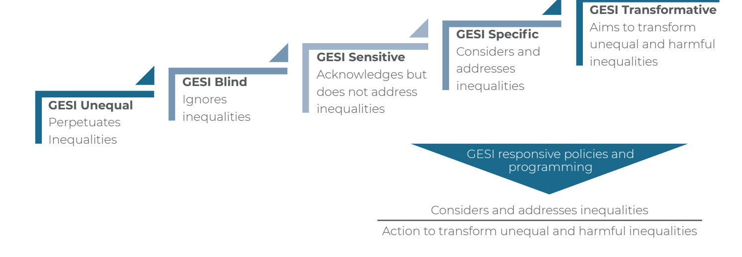
Figure: 1 GESI-Responsive Assessment Scale

The toolkit acts as a roadmap, so that the incorporation of GESI into project activities and processes can be considered along a continuum – from GESI sensitive to GESI specific to GESI transformative. All Health Partnerships should aim, as a minimum, for a GESI sensitive approach, moving along the continuum where it is possible and relevant to do so.